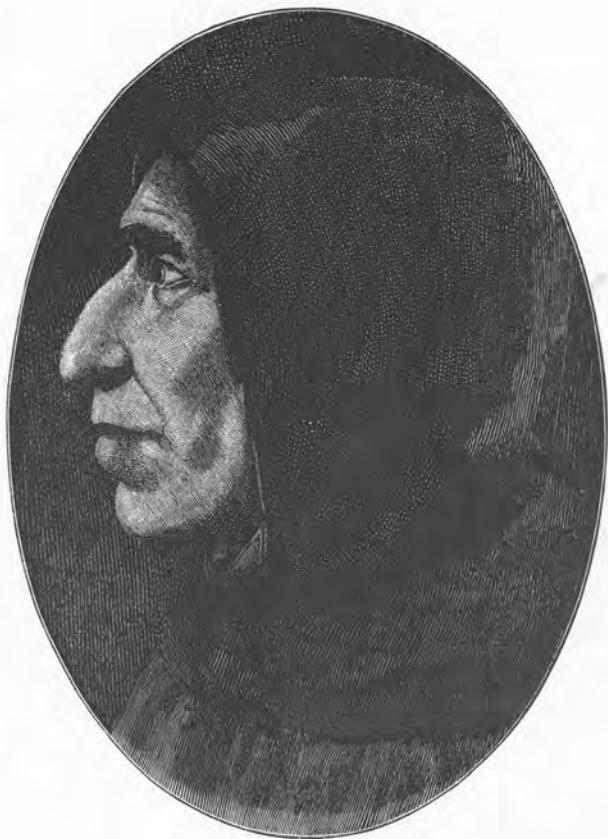
FRATE HIERONYMO SAVONAROLA. (From a Painting by Fra Bartolommeo.)