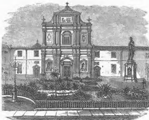
SAN MARCO, FLORENCE.

AUTHOR OF "THE STORY OF MARTIN LUTHER," ETC.