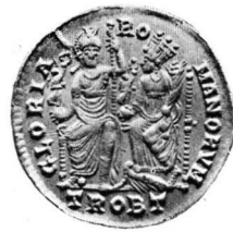
COIN OF GRATIAN.