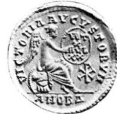
COIN OF VALENS.