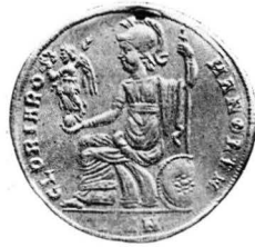
COIN OF CONSTANTINE THE GREAT.