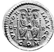
COIN OF THEODOSIUS I.