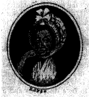
The Right Hon. Selina Countess Dowager of Huntingdon