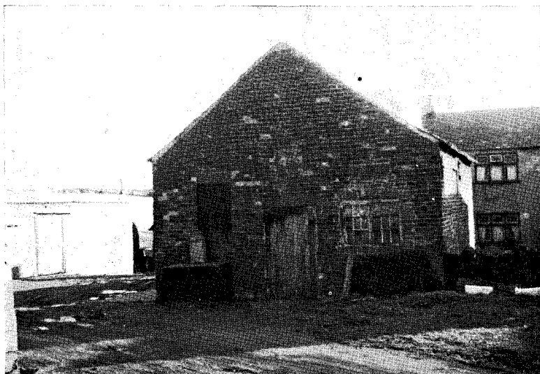
SELSTON PRIMITIVE METHODIST CHAPEL (Belper Circuit). Built 1826. The church from which the Original Methodists broke away to build their own "Middle" Chapel. Demolished January 1966.