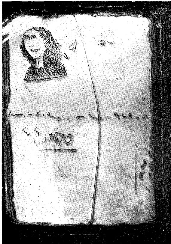
INSCRIBED WINDOW-PANE (1), AT ELDWICK CRAGG, BINGLEY.

SIZE OF PANE 5\frac{1}{4} x 3\frac{1}{2} INCHES.