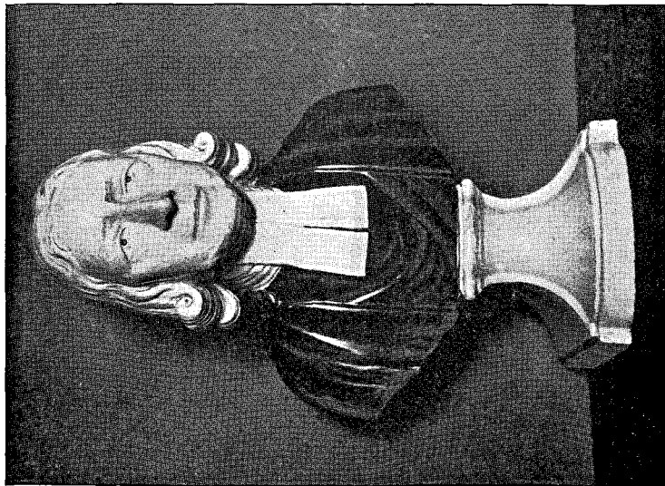
1. Front view.