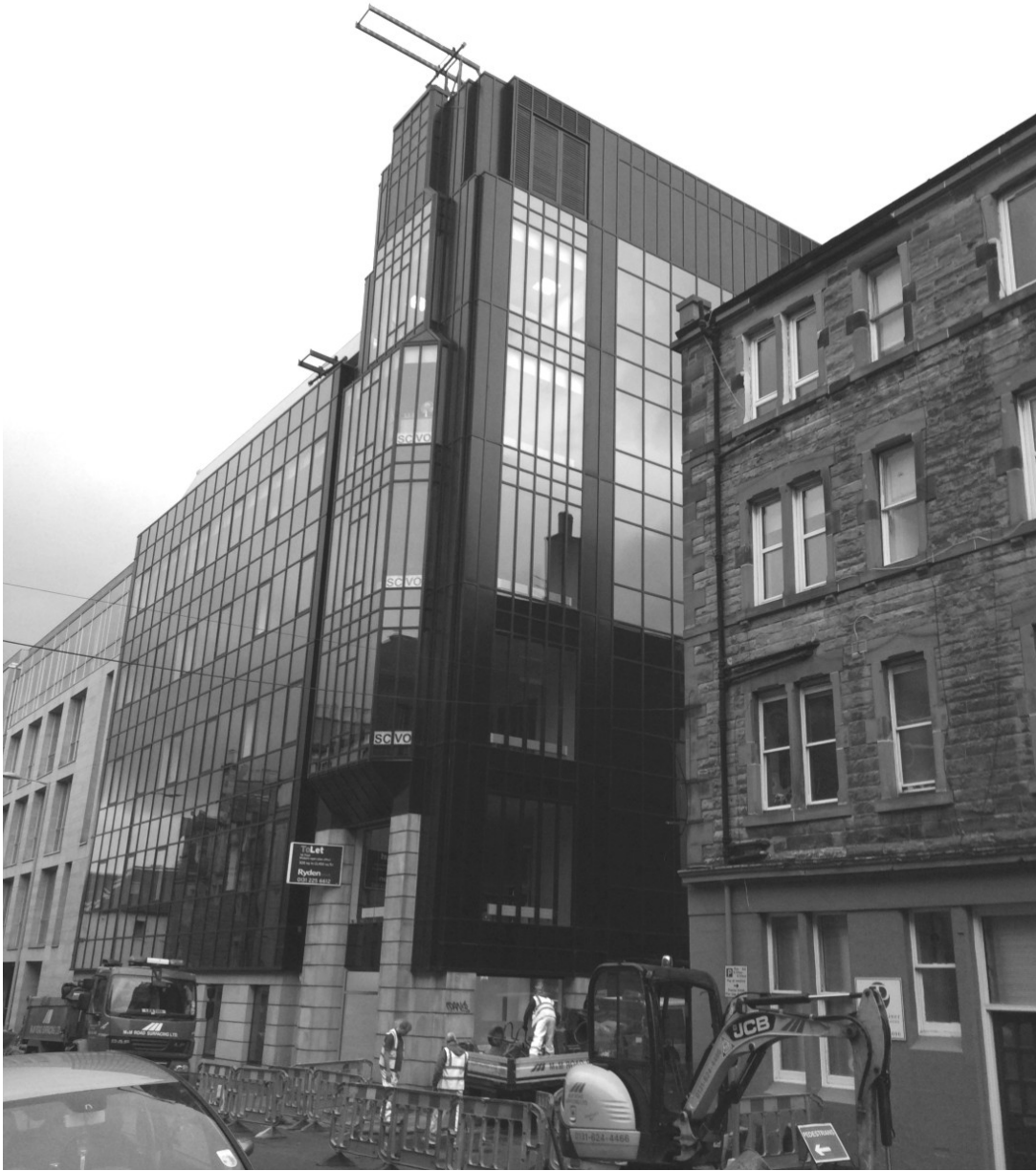
Lauriston Street in the present day. The gap between the tall glass building on the left and the older tenement on the right is the lane by which worshippers gained access to the Original Secession church.

held on the Friday. 114 In a list of services held at Lauriston Street during the October 1861 communion season, there is a tantalising hint of there being some kind of gathering for discussion, rather than preaching, on a Thursday evening – this in addition to preaching services earlier in the