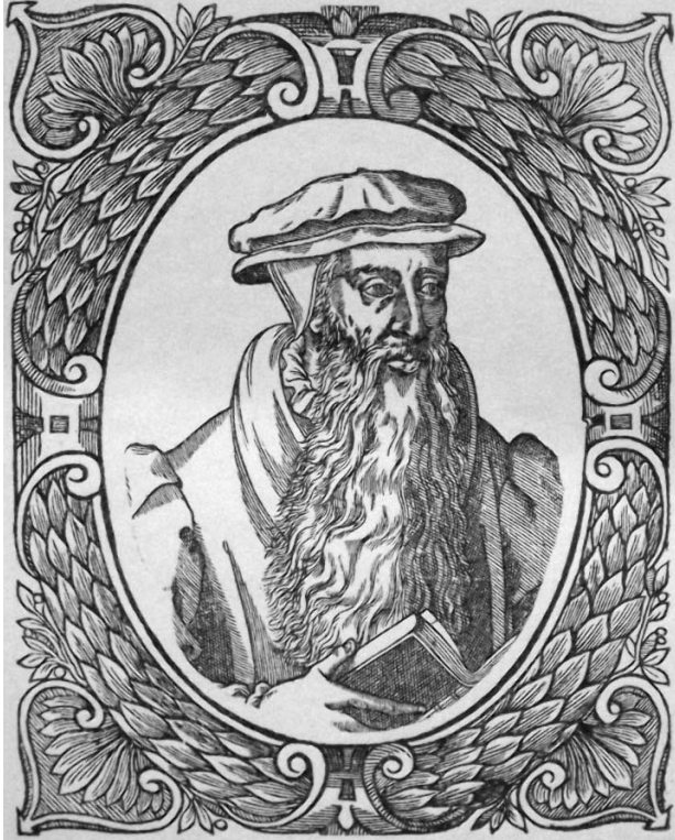
John Knox, c. 1514-1572.