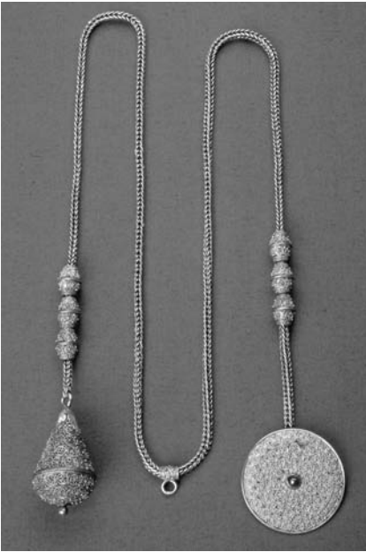
Silver chain found in Marischal College in 1735, possibly hidden at the time of the Reformation.