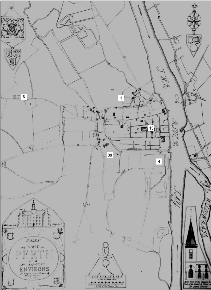
Map of Perth in 1765.