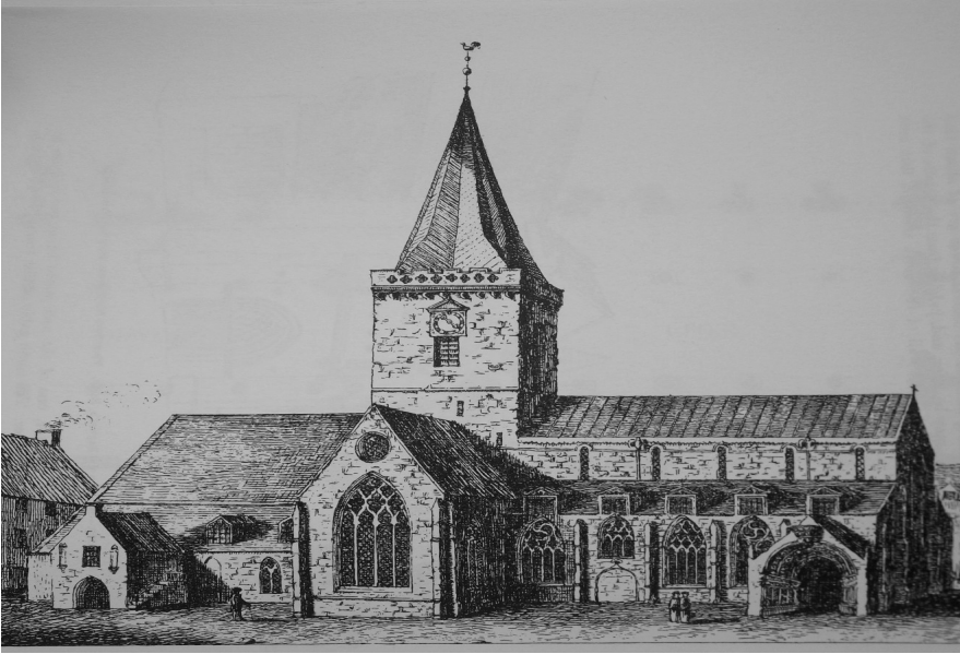
St John's church in 1775. The porch from the Charterhouse is on the right hand side.