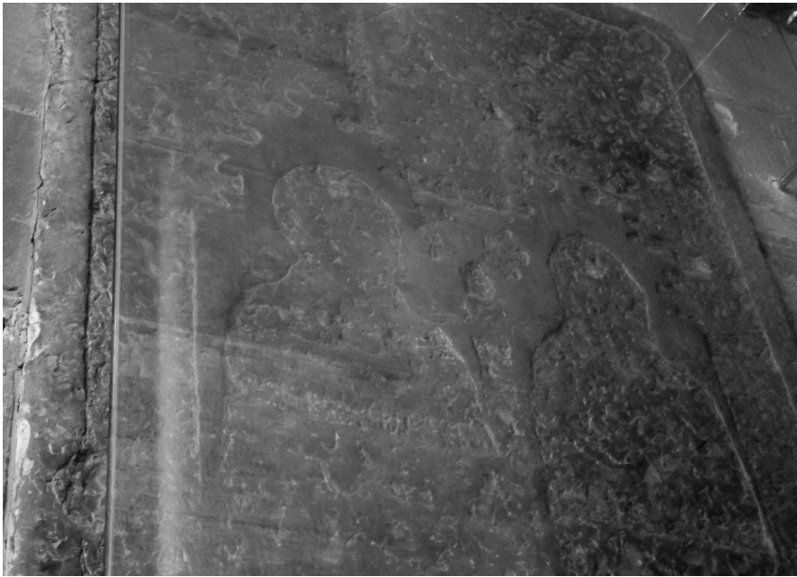
The tombstone of James I and Joan Beaufort, now on the east wall of St John's church.

destruction appears to have been thorough: the royal tomb of James I and Joan Beaufort was dismantled, presumably because of certain idolatrous features; while outside even the trees were destroyed, perhaps partly for military reasons. 88 Other than the valuables carried away by the prior, the only items known to have survived were a gateway that was subsequently incorporated into the parish church, though later demolished; 89 the doublet in which James I had been murdered; 90 a number of charters; 91 at least three books from the library; 92 and the royal tombstone of James I and Joan Beaufort. This formed part of the floor of the choir of the parish church for three centuries until it was moved to the east wall where it remains at present. 93