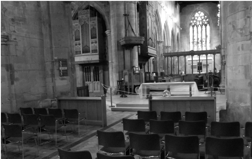
The interior of St John's church. The pulpit is thought to be on the site of the one used by Knox. The mass would have been performed at the far end under the window.