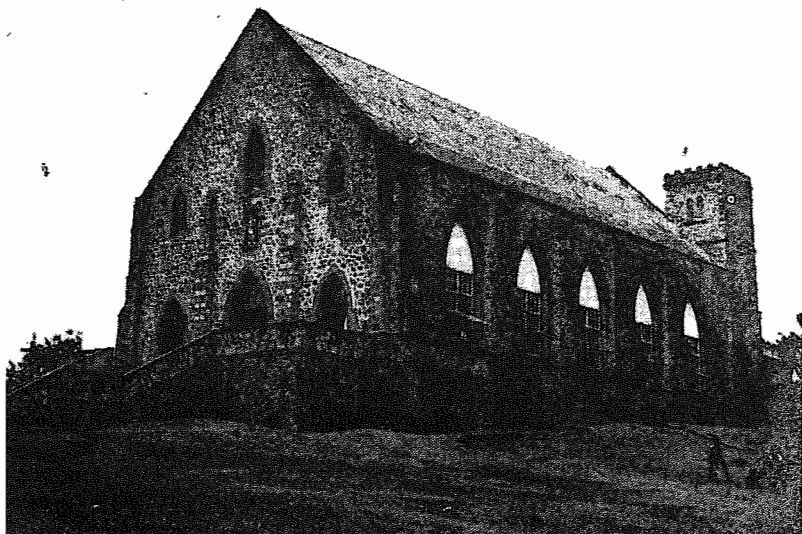
A Roman Catholic church in Grenada's Tivoli area.