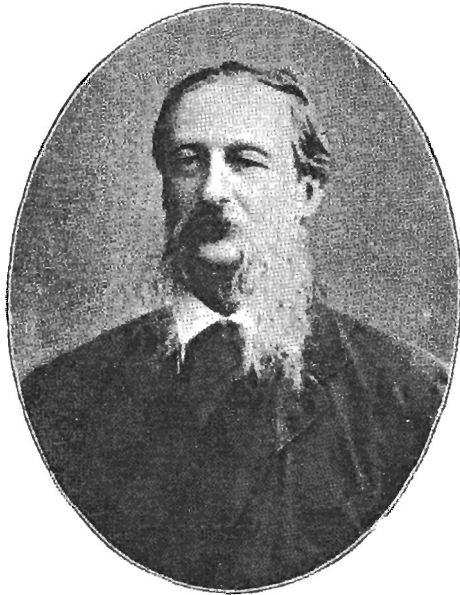
Colonel Pashkov, converted through Lord Radstock's missions to St Petersburg in the late 19th century. In April 1884 he convened a conference of Russian Evangelicals, but was banished from Russia by the Tsar only two months Later.