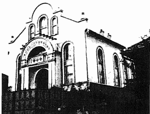
Right: Medias Baptist Church, Romania.