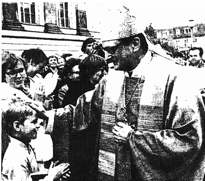
Three of the four newly-created Cardinals in Eastern Europe. Above Cardinal Joachim Meisner of East Germany, below left Cardinal Franjo Kuharić of Yugoslavia, and below right Cardinal Józef Glemp of Poland. For biographical information, see pp. 204-7.