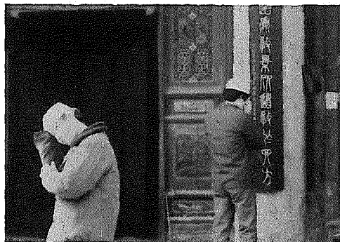
Worshippers waiting for the start of the ceremony at Xian Great Mosque.