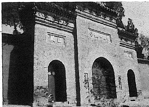
The Buddhist Monastery of Flourishing Doctrine near Xian.