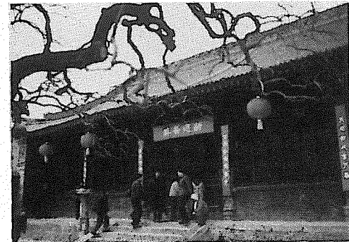
The Buddhist Great Goose Pagoda in Xian.