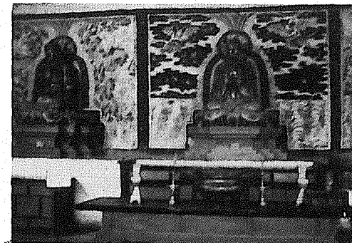
The interior of the Great Goose Pagoda showing the altar decked for use.