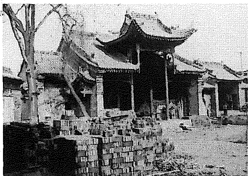
The rear courtyard of Xian Great Mosque: parts of the Mosque are undergoing thorough renovation. See the article pp. 274-8.