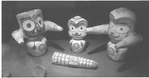
R.-L. Jagannatha, Subhadra, Baladeva, Ashmolean Museum, Oxford.

God's energy is everywhere. God is not different from His energy just as the sun is not different from the sunshine; therefore it is correct to say that God, in His energy, is everywhere. However, it is not possible for us to establish an intimate relationship with this impersonal, all-pervasive aspect of God. Therefore, to enable us to relate to Him personally, God, the Supreme Person, descends to the material world in the authorized form of the Deity. 13