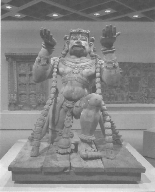
Hanuman (Denver Art Museum)

work out the real difference between the Yahweh and Vishnu, between Krishna and Christ, but all the while the Second Commandment, which had to do with a simple point of religious practice, came to my rescue.