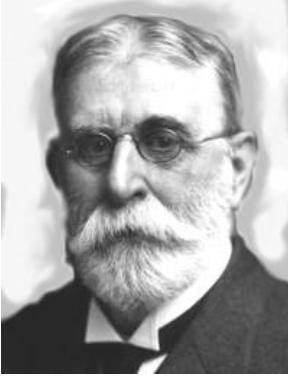
BENJAMIN B. WARFIELD Professor of Theology Princeton Theological Seminary

OUR Lord and his Apostles looked upon the entire truthfulness and utter trustworthiness of that body of writings which they called “Scripture,” as so fully guaranteed by the inspiration of God, that they could appeal to them confidently in all their statements of whatever kind as absolutely true; adduce their deliverances on whatever subject with a simple “It is written,” as the end of all strife; and treat them generally in a manner which clearly exhibits that in their view “Scripture says” was equivalent to “God says.”