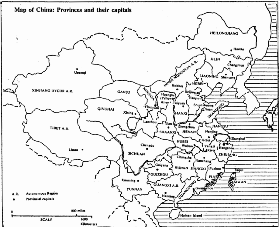
Map of China: Provinces and their capitals