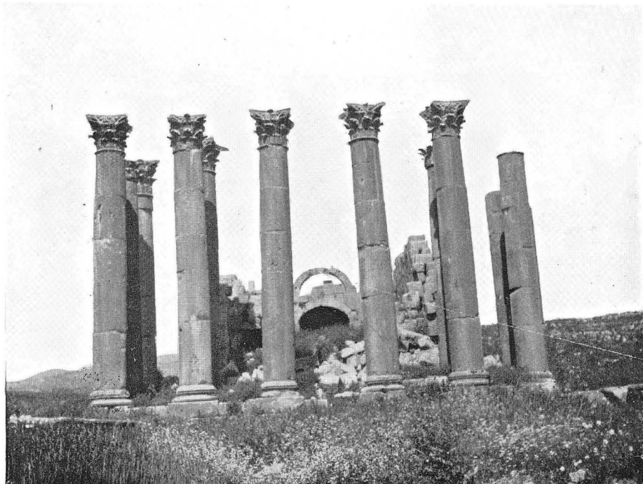
II.—TEMPLE OF THE SUN AT JERASH.