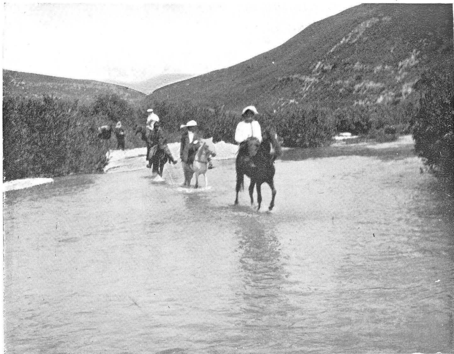
I.—FORDING THE RIVER JABBOK.