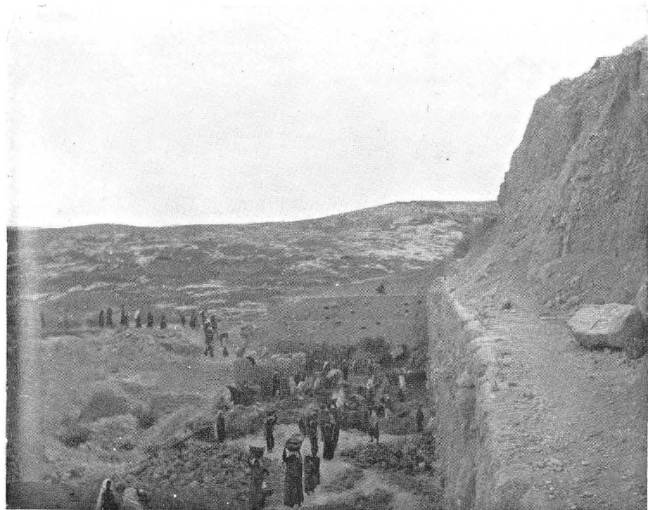
IV.—PROFESSOR MACALISTER'S EXCAVATIONS AT GEZER.