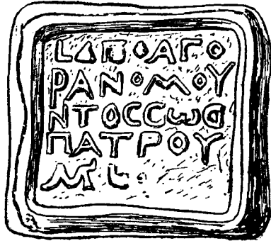
FIG. 4.—GEZER MARKET WEIGHT.