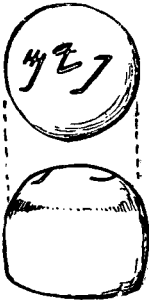
FIG. 3.—HEBREW WEIGHT, INSCRIBED פים OR פיש (?).