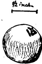
FIG. 2.—PALESTINIAN WEIGHT WITH PREVIOUSLY UNKNOWN SYMBOL.