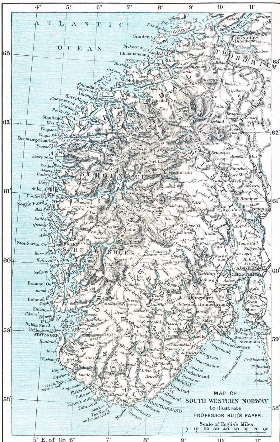
MAP OF SOUTH WESTERN NORWAY to illustrate PROFESSOR HULL'S PAPER.

Scale of English Miles 0 10 20 30 40 50 60 70 80