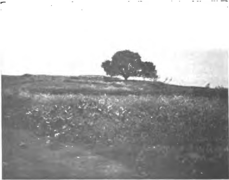
KERSA (FROM THE EAST)

3. The geographical evidence also fails to support Gergesa. No place of that name is found to-day, and the places whose names are the nearest approach to it lack some of the essential features of the account. Gerasa is supposed by the majority of commentators to be identical with Kersa (or Kursi) at the mouth of the Wadi es-Samak, on the northern