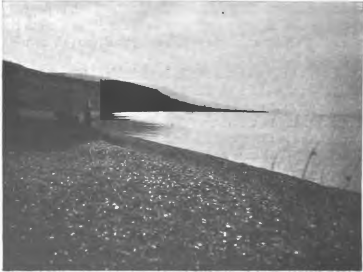
LOOKING SOUTH FROM KERSA