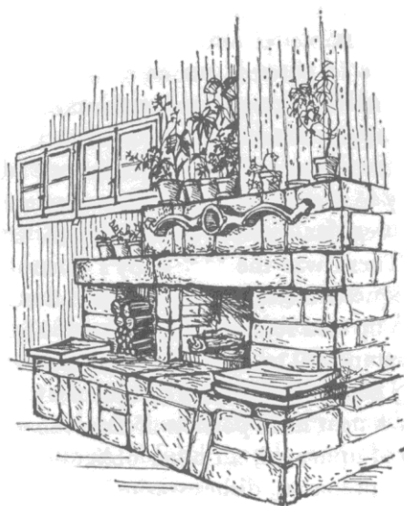
The chapel fireplace

discusses. She urges Christians to use their God-given capabilities and to take their responsibilities seriously.