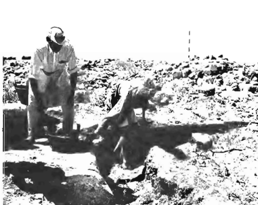
Church apse in process of being cleared.