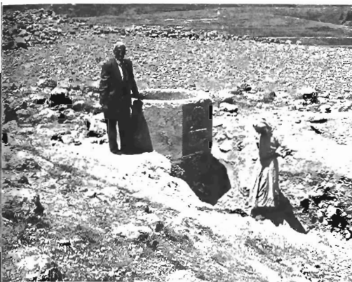
Baptismal font--Byzantine period.