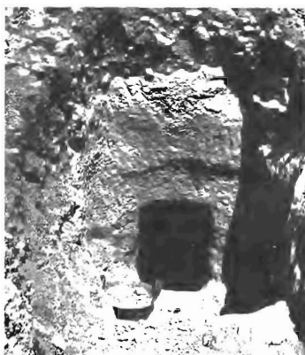
Entrance to Iron Age tomb.