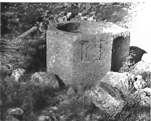
Baptismal font--Byzantine period.