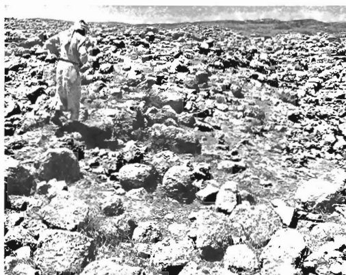
Surface of Tekoa showing Byzantine and Crusader ruins.