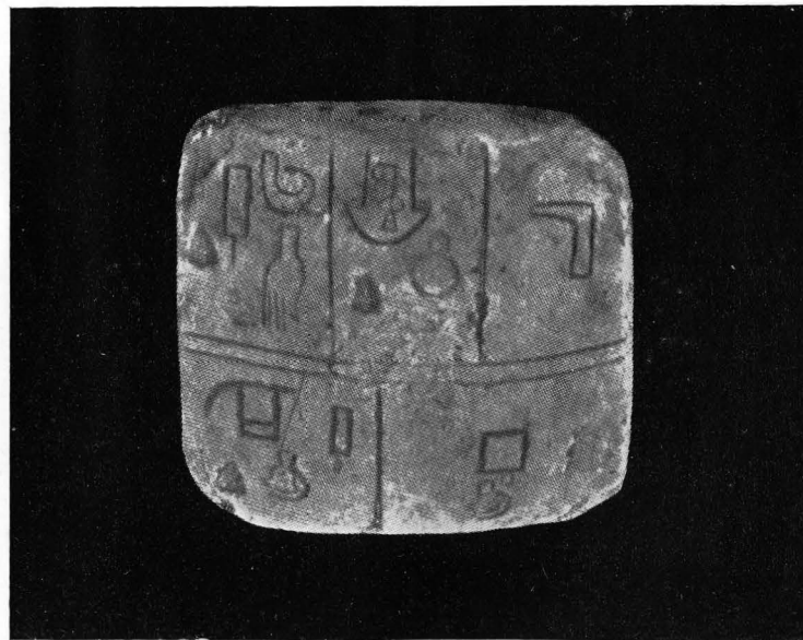
Specimen of earliest period of Sumerian pictographic writing. Found at Kish. This tablet does not contain the name of a deity, but others of the same period from Erech contain the names of two deities, the Sky-god and the Queen of Heaven.