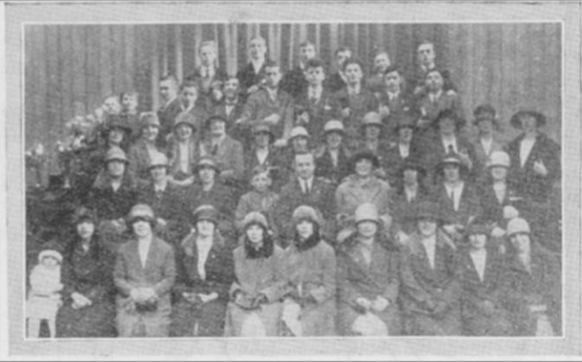
Some of the Plymouth Crusaders

Plymouth Crusaders. A rally was recently held with a view to the reorganising of this powerful and progressive Young