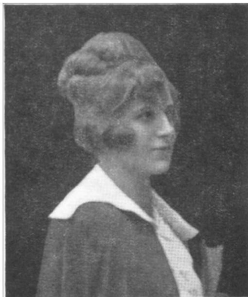
AIMEE SEMPLE MCPHERSON

Like all triumphant pioneers who have gone before, she was loved by countless multitudes everywhere, and was also a target for the poisonous arrows of envy and jealousy. To-day, she is beyond the aim of those