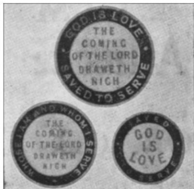
Illustrations are full size