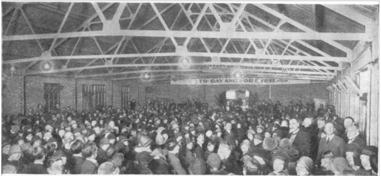
A BAPTISMAL SERVICE IN THE NEW ELIM TABERNACLE, EAST HAM

Though this is the fourth week since the hall was opened, the revival is still in progress—and this is not owing to advertisement, but due to the wonderful