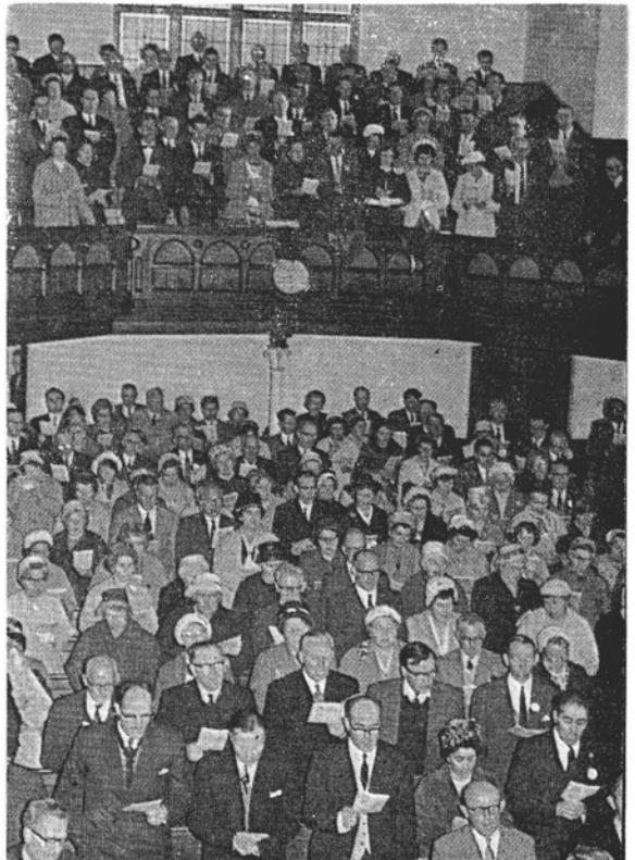
Section of the great congregation at the missionary rally.