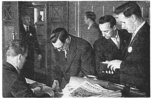
Signing in on the opening day at Skegness.

The American Crusader Trio sing again: "I found what I wanted when I found the Lord," and "How great Thou art." In the latter great piece major and minor chords alternate with frequency and skill. What accomplished singers these consecrated brethren are.