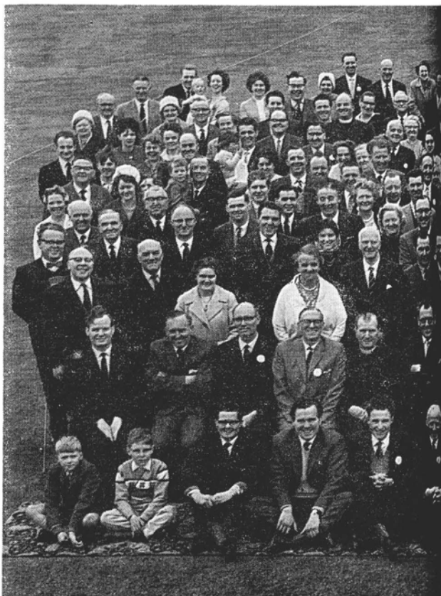
Ministers, delegates and visitors on the lawn of the Y.M.C.A. holiday centre, Skegness.