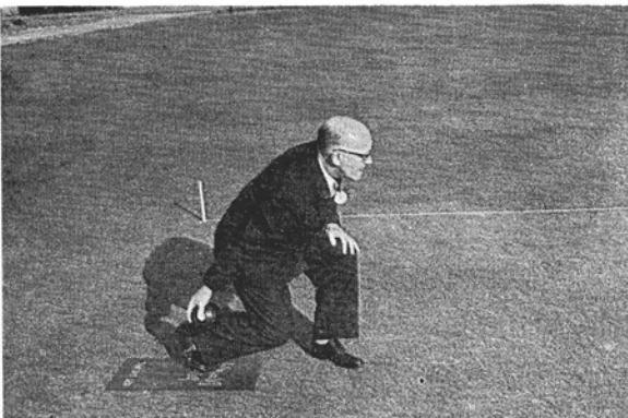
Relaxation—he has a Way with him!