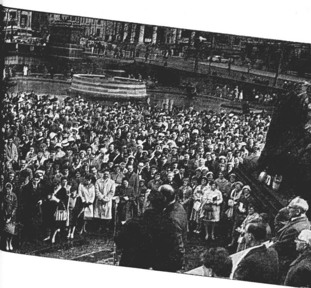
...Square, ...political demonstration, and ...makers, sightseers and tourists.