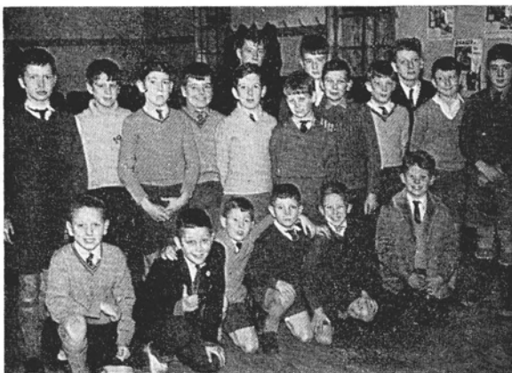
Paisley boys' team No. 1.