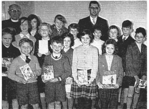
Sunday school prizegiving at Acomb, York.