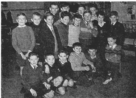
Paisley boys' team No. 2.

From among these lads new scholars have been introduced into our church Sunday school, and occasional visits to the church have been arranged when special features have been planned. It has been most encouraging to see the response shown by these lads to this project; although it is very sad to see the amount of darkness which prevails among them. This