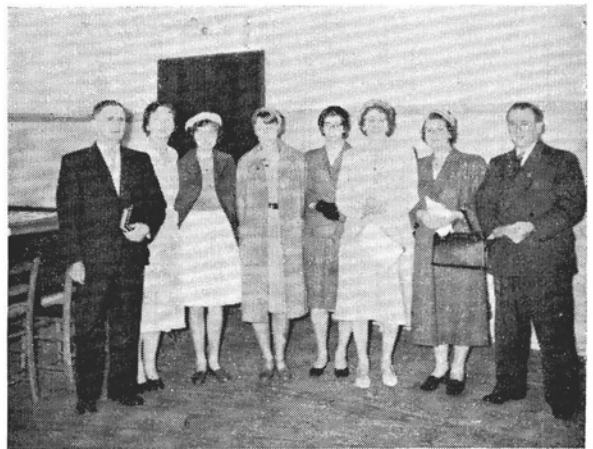
These people were all healed in the Portsmouth campaign.