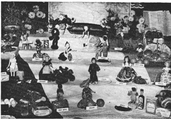
shows the unusual harvest display at Southend-on-Sea, entitled "The harvest of the world."