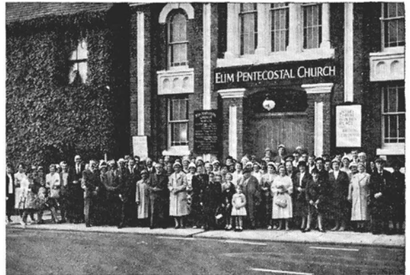
Crowds gather for the reopening of Lowestoft minor hall.