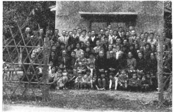
A group of believers at Yuan Shan, Formosa.