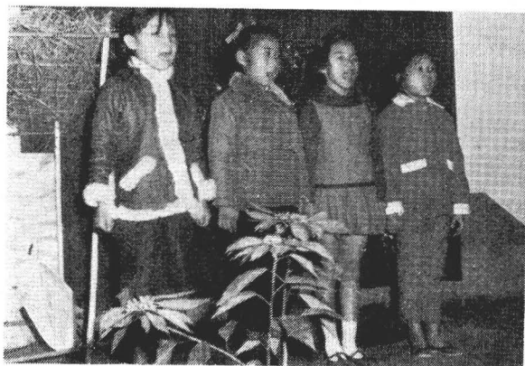
Girls' quartet at Yi Lan, Formosa.