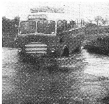
The bus from Inyanga attempts to cross the river Mwenje.