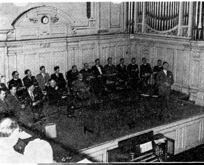
Platform party at the annual Manchester rally in the Houldsworth Hall.

One happy outcome has been that an unconverted person in the service was so convicted that the next day she yielded to Christ.