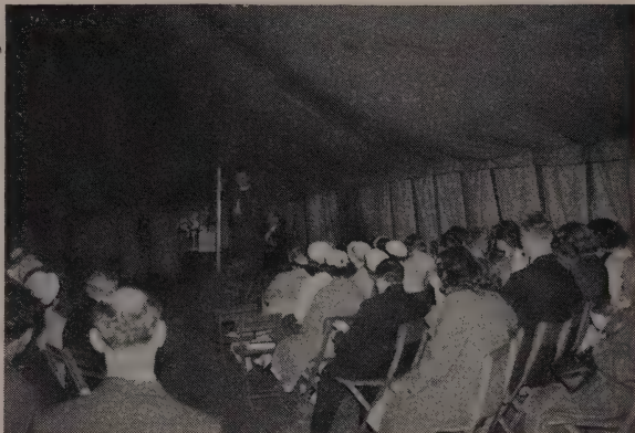
The platform and part of the youth choir at the Bradford crusade.

The crusade, lasting two weeks, was all too short. Crowds came, over 5,300 in all, this being eloquent testimony to the outpouring of God's Spirit. Attendances were excellent every night despite some very stormy weather. At every service young and old responded to the appeal; in all 240 came forward and signed decision cards, and over 500 came requesting prayer for physical infirmities. A great number of these were healed, many