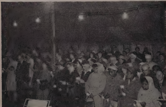
Part of the congregation on the opening night of the Bradford crusade.

As the crowds are now making their rendezvous in the Southend Hall Elim Church, many are saying that this is the greatest crusade in Bradford for many years, and we thank God for His blessing and you for your earnest prayers.