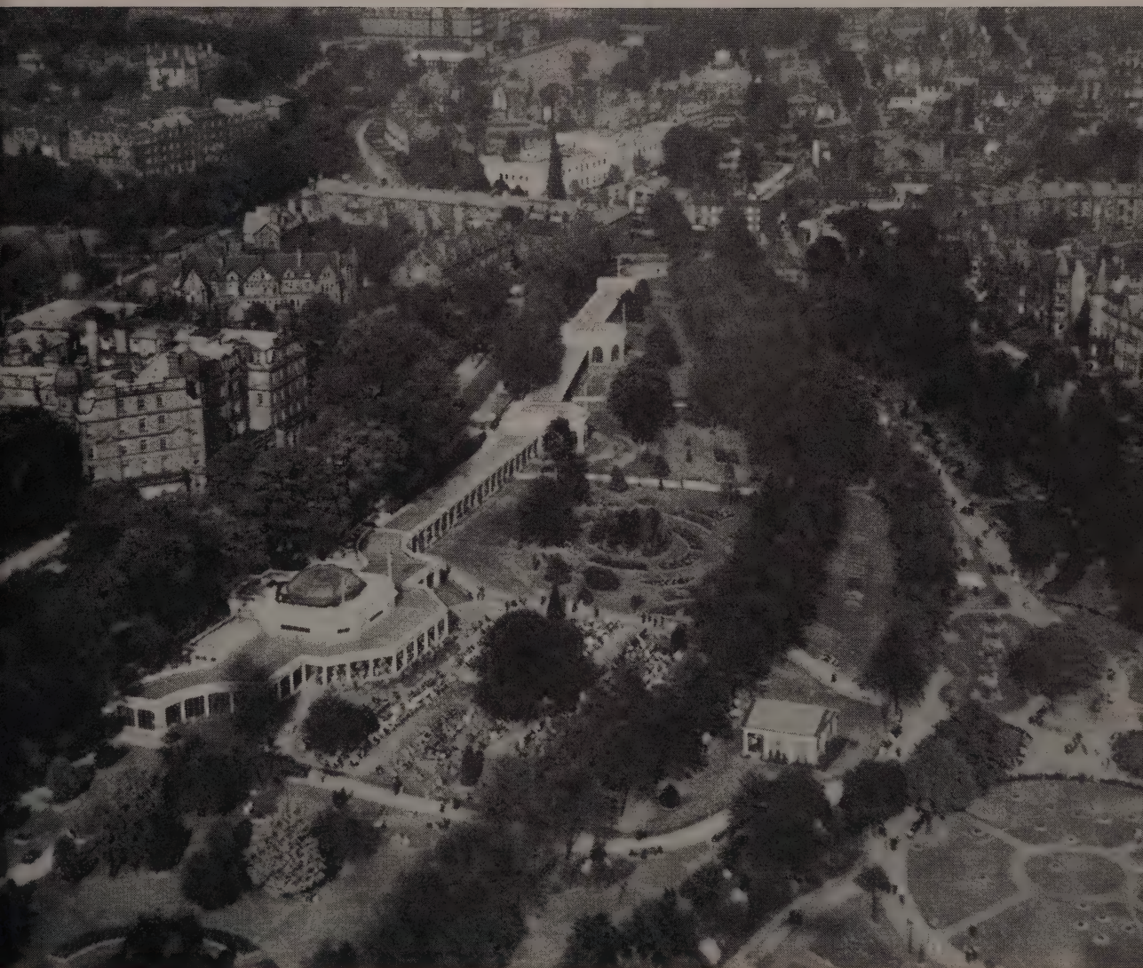
THE SUN LOUNGE, HARROGATE, WHERE SOME OF THE CONFERENCE SESSIONS WERE HELD, AND BEHIND IT THE GRAND HOTEL, WHERE DELEGATES AND VISITORS WERE ACCOMMODATED.