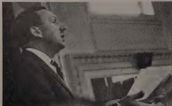
The Youth Director addresses the conference.

There is also great importance in understanding from the viewpoint of youth itself. To be understood immediately strikes a sympathetic link between the young person and you. Many young people feel isolated from their leaders because they know they are not understood. The apex of this understanding of another was achieved by our Master, of whom it is written: "For we have no superhuman high priest to whom our weaknesses are unintelligible—He Himself has shared fully in all our experience . . ." (Hebrews 4:15—Phillips). How often