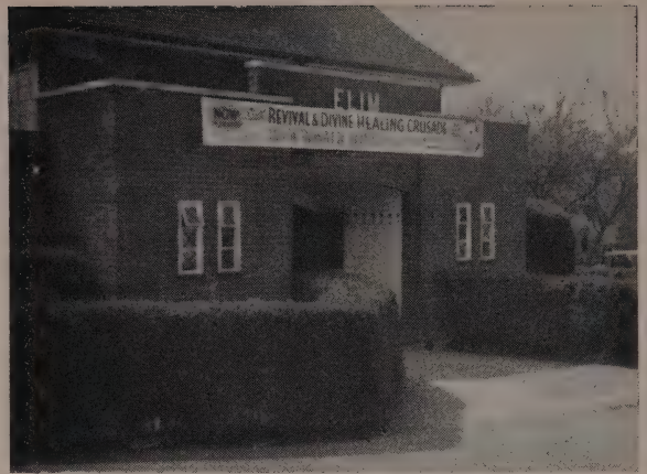
Letchworth church with crusade banner.