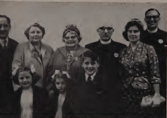
The President and his family with the retiring President.

Let me appeal to any who have not accepted Jesus Christ as their personal Saviour to accept the good news of salvation and believe the Gospel. Some may