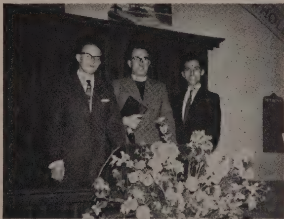
The crusade party at Letchworth.