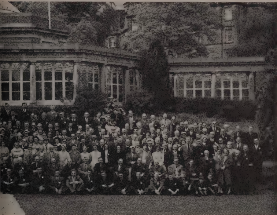
in front of the Sun Pavilion, Harrogate.

ditiously: the adoption of the conference personnel, the appointment of scrutineers and the presentation of the Executive's plan for the execution of the week's business. A request from the chair that those who wanted copies of rules relating to public debate should ask for them was met with a negative response, showing that members did not need to be