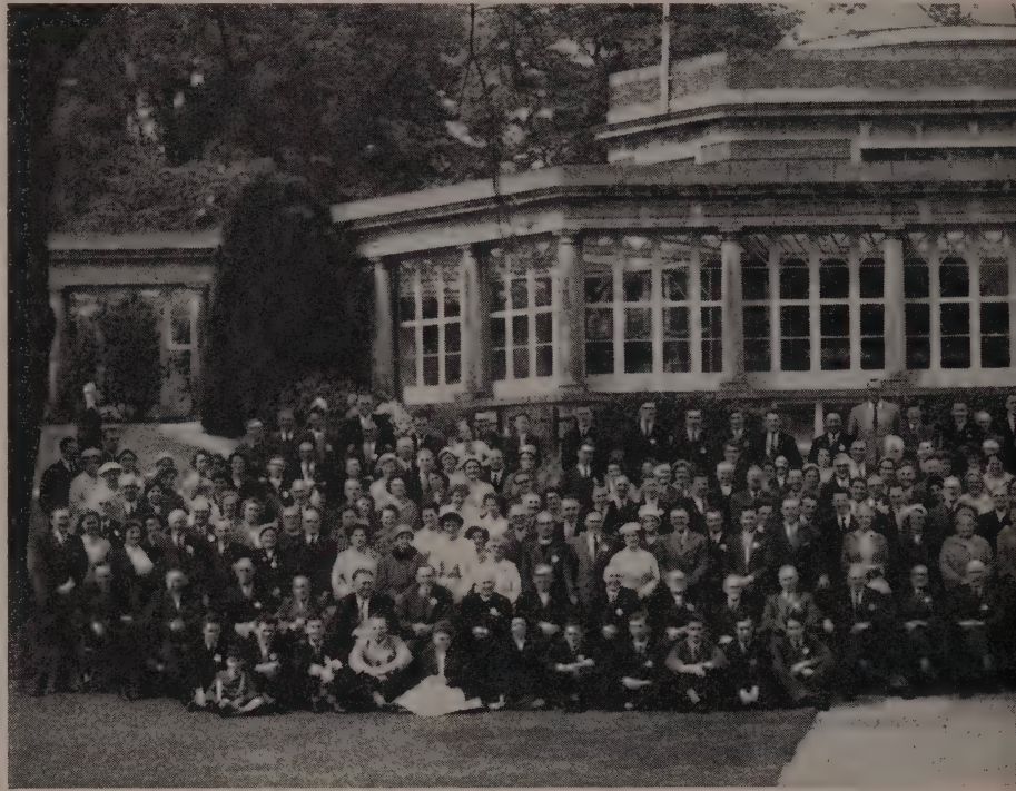
Delegates and visitors to the Elim Conference

The President, now in the business chair, made