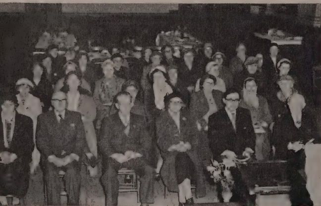
Ryde Sisterhood fellowship tea.

For His blessing we praise God and look forward in eager anticipation to the future.