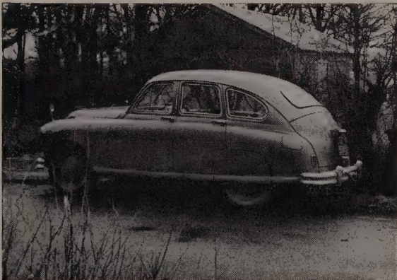
Portable hall with Vanguard car in front.