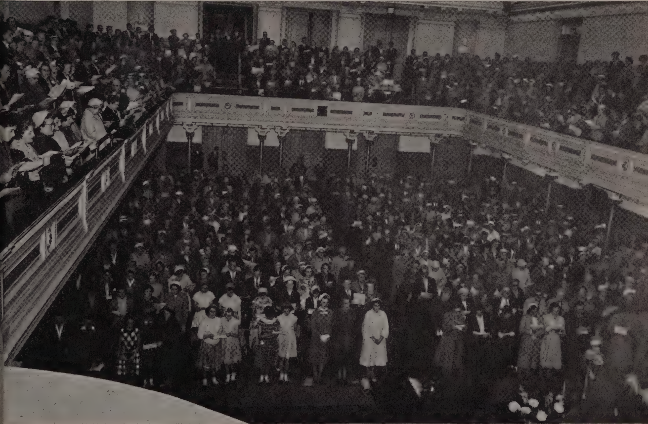
CROWDED GATHERING AT PAISLEY CAMPAIGN