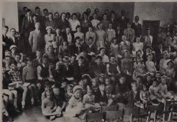
Sunday school anniversary at Leigh-on-Sea.