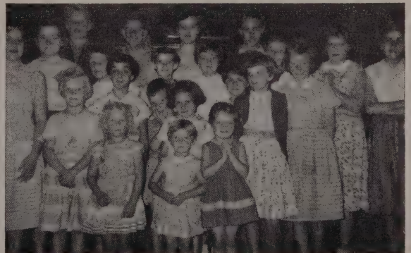
Children at Lincoln "Sunshine Corner" campaign.