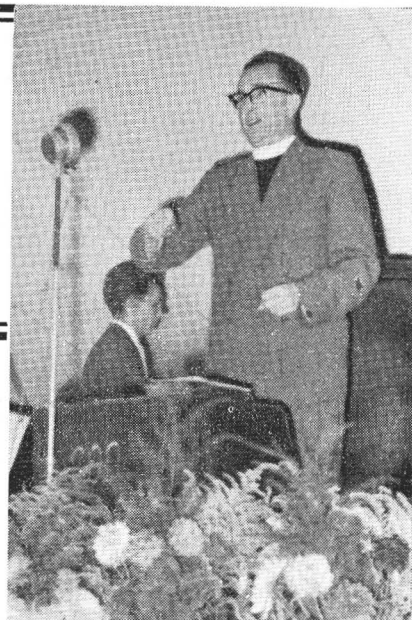
The evangelist seen in action as he leads the congregation in the singing of choruses.

had been totally deaf for a month, but as she entered the tent she, to use her own words, "felt the power of God and I was able to hear everything. I am so very overjoyed." Another lady writes as follows: "I have been ill with an ulcer, and on the verge of a nervous breakdown for months. I have lost nearly two stone in weight in the past six months; have not been able to sleep without the help of drugs and