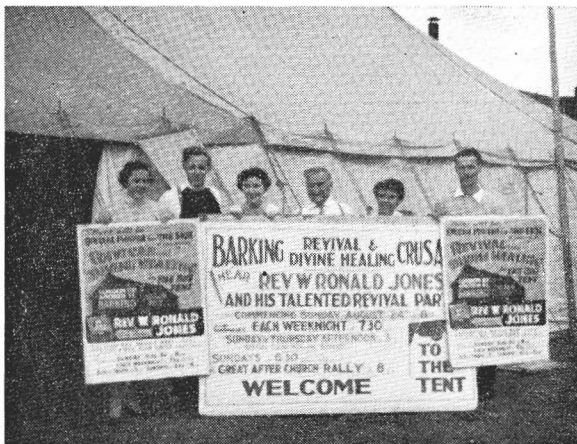
Some of the workers outside the tent on Saturday before the commencement of the campaign.

Reader, you can have a part in this grand work of winning souls for Christ, not only by praying but by sending your gifts to the Evangelistic Secretary, 20 Clarence Avenue, Clapham Park, London, S.W.4.