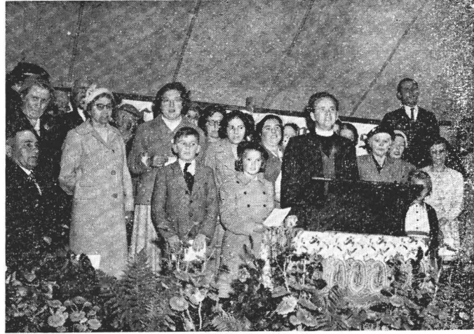
The evangelist with about forty people who testified to being healed.