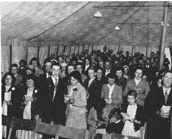
Section of the large congregation in the tent during the campaign.

Please help to spread the Gospel by sending your gifts to : Evan- gelistic Secretary, 20 Clarence Avenue, Clapham Park, London, S.W.4.