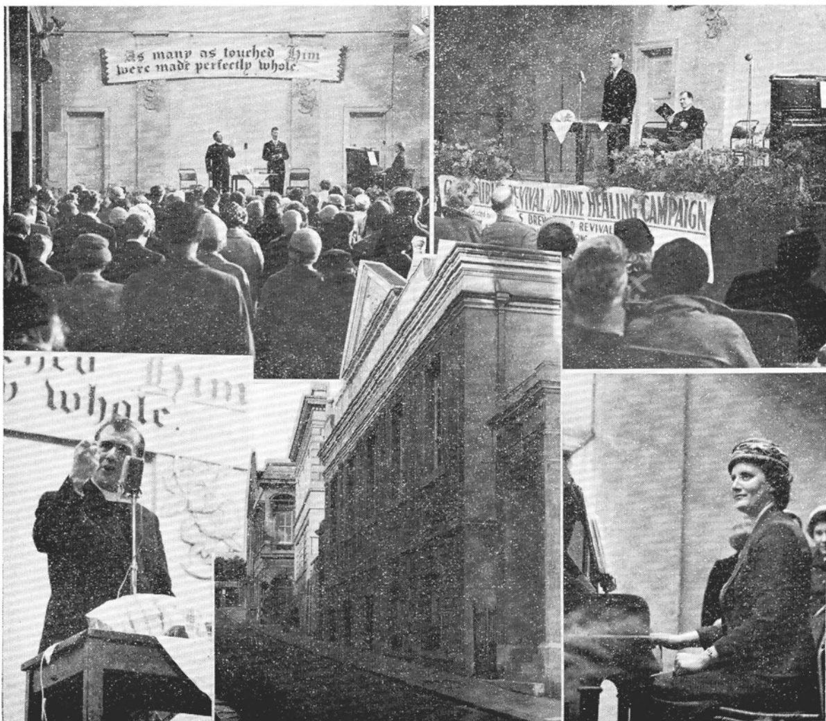
Photo News of Exeter Campaign