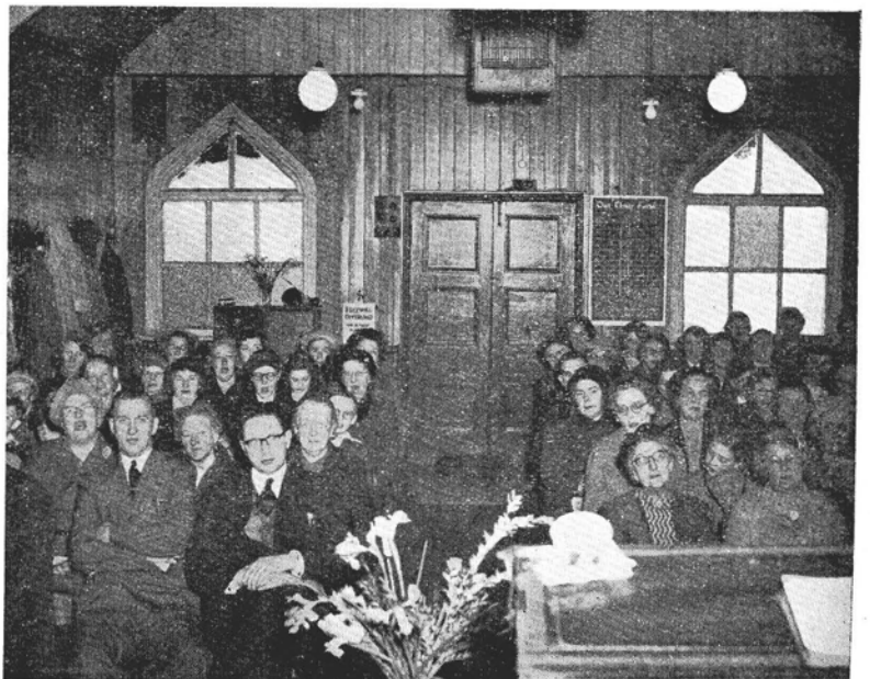
Section of congregation at Nelson Rally.