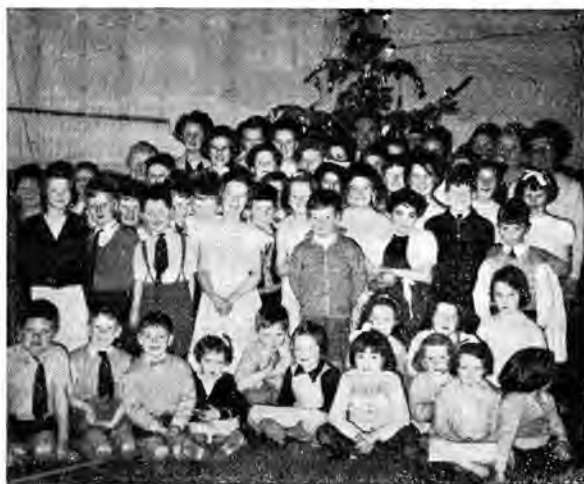
Kirkintilloch Sunday School Party.