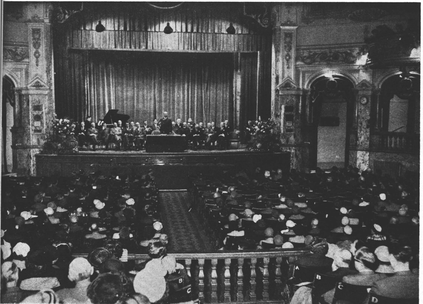
Front view of the Royal Hall, Harrogate, showing the Monday evening meeting in progress.

Witnessing to the fulness of the Gospel of our Lord Jesus Christ