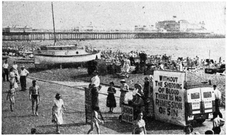
Open air witness on the sea front, Brighton.

Recently, after a sister had been speaking to a man and wife at the open air for about half an hour he left with this remark: "That's the man I am" and gave us a newspaper cutting of himself. His wife was up for trial, accused of attempted murder, stabbing him at Brighton with a