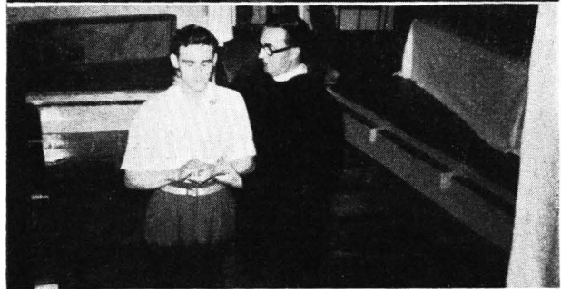
Baptisms in the City Temple, Bristol.