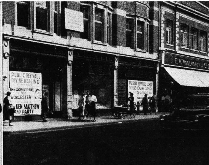
A new and very effective method of advertising a campaign. Three shops next door to Woolworth's were kindly loaned by Messrs. Woolworth. Two shops were used for large posters, the centre one was used to display literature.