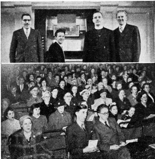
Top: The Campaign party (with a visiting minister) on the platform. Bottom: The crowded congregation eager to hear the Word of God.

arms. In answer to prayer she walked immediately and without assistance. Walking across the front of the hall she immediately became a glorious testimony to the miracle-working power of Jesus Christ.