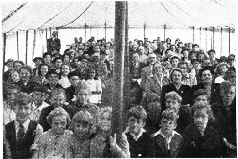
TENT CAMPAIGN AT WEMBURY

Many were won for Christ and added to the Church, and this was confirmed in many instances at the Baptismal service held in the church at the end of July, when twenty-