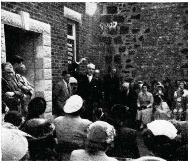
An Elim minister goes into action outside the new building, before the opening ceremony.